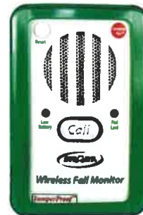
TL-2016R3 Quiet Wireless Fall Monitor

The TL-2016R3 Quiet Wireless Fall Monitor works with low cost sensor pads and mats. Also has a built in nurse call button on the front of the monitor. When the fall monitor alarms, it will send a quiet wireless signal to the central monitoring unit to notify the caregiver.